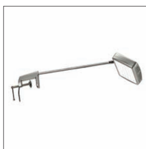
Reflector tija LED A++ EUR 45.00 16W 1100LM 4000K ARM33CM Cod 019.010.200.040