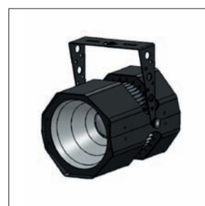
Reflector LED VIRGO EUR 50.00 40W 4350 LM 4100 K Cod 019.010.200.045