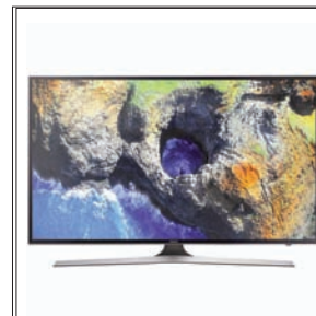
TV SAMSUNG UHD EUR 85.00/day (diagonal screen: 163 cm) Code 025 010 130 047