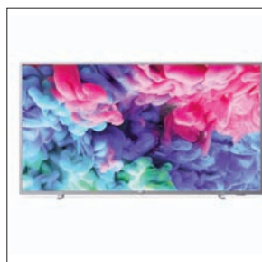
TV LED SMART 4K, EUR 55.00/zi UHD ultrasubtire (diagonala ecran: 126 cm) Cod 025 010 130 045