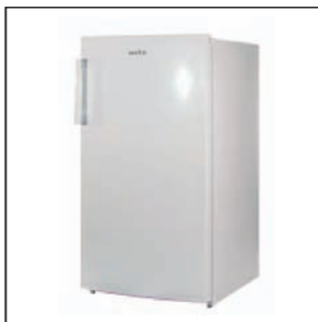
Frigider ARCTIC FB 155 EUR 36.00 Cod 025 010 020 198