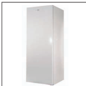
Frigider ARCTIC 255 l EUR 80.00 Cod 025 010 020 199