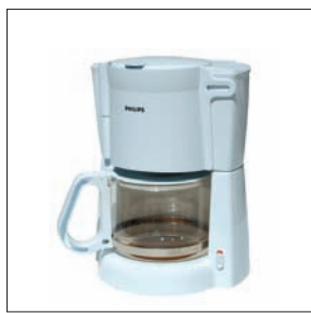
Filtru de cafea EUR 10.00 Cod 025.010.120.010