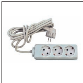
Prelungitor 230V, 10A, 3m EUR 18.00 Cod 019.010.277.000